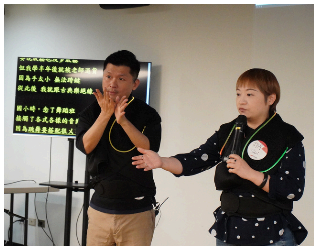
The 5G immersive wearable device