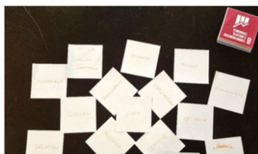
PICTURE 6 - OVERTURNING THE 2030 AGENDA: NEW SLOGANS FOR THE SDGS, AS PROPOSED BY A PARTICIPANT DURING THE COLLABORATIVE ACTIVITY

2) On the second day, a collaborative activity dedicated to the SDGs was carried out, in which each participant was explicitly asked to select and present an SDG that, in their opinion, had priority over what was discussed on earth/soil, and best gave back their point of view and specific interest of the attendee (Picture 5). In this activity, we have found in the artists a feeling of discomfort and limitation to creativity, generated by conforming to slogans distant from the emotions of a creative activity such as the theatre work, to the point of one participant wanting to overturn the Agenda and proposing completely new objectives (Figure 6). On the other hand, scientists have shown love and hate-sentiment towards a limited, limiting, and homogenized glossary of objectives, which nevertheless brought sustainability issues to the attention of the wider society, building a common glossary to catalyze different capacities around urgent environmental and social challenges.