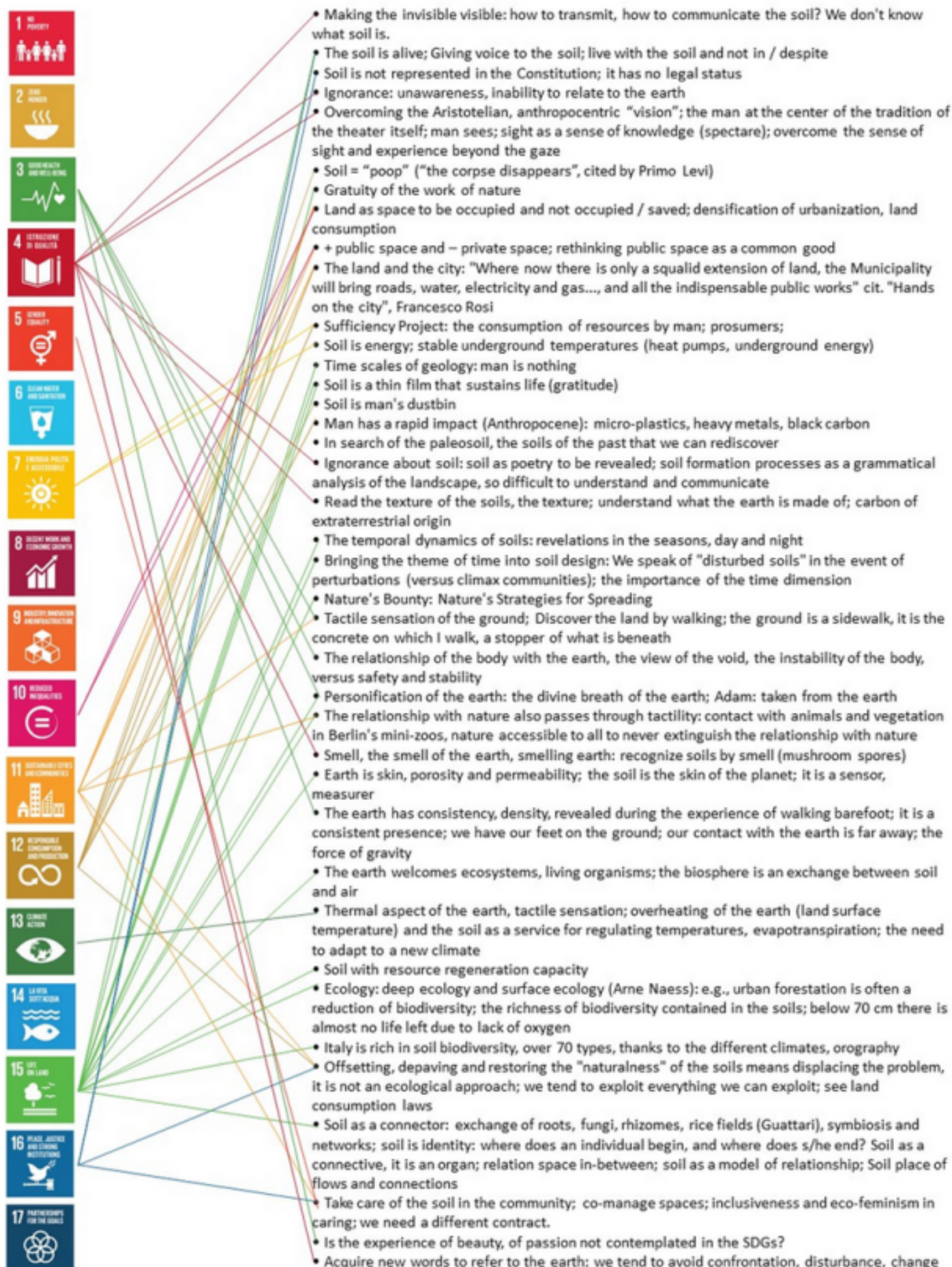
TABLE 1 - CONNECTING THE TOPICS DISCUSSED DURING THE 3 DAYS WORKSHOP TO THE 2030 AGENDA