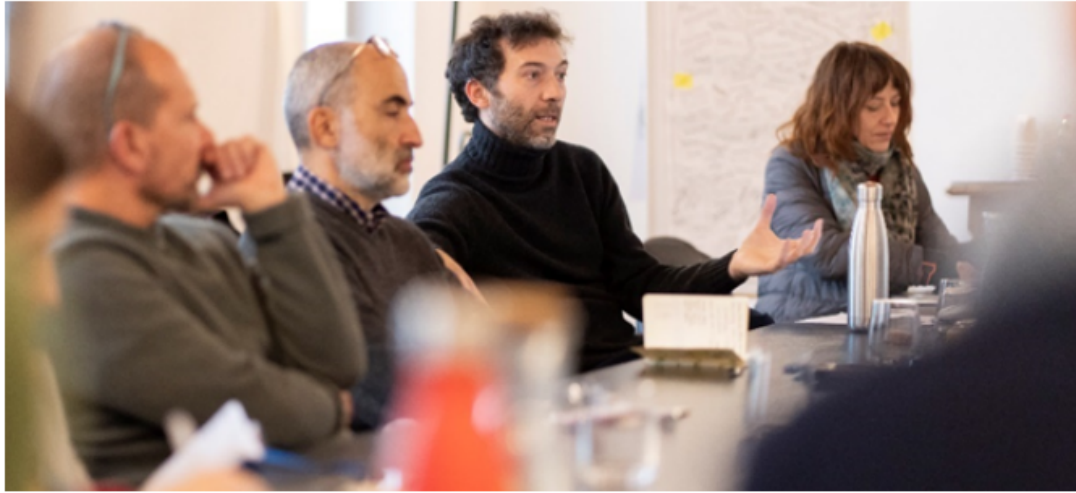
PICTURE 2 - DISCUSSIONS DURING THE WORKSHOP