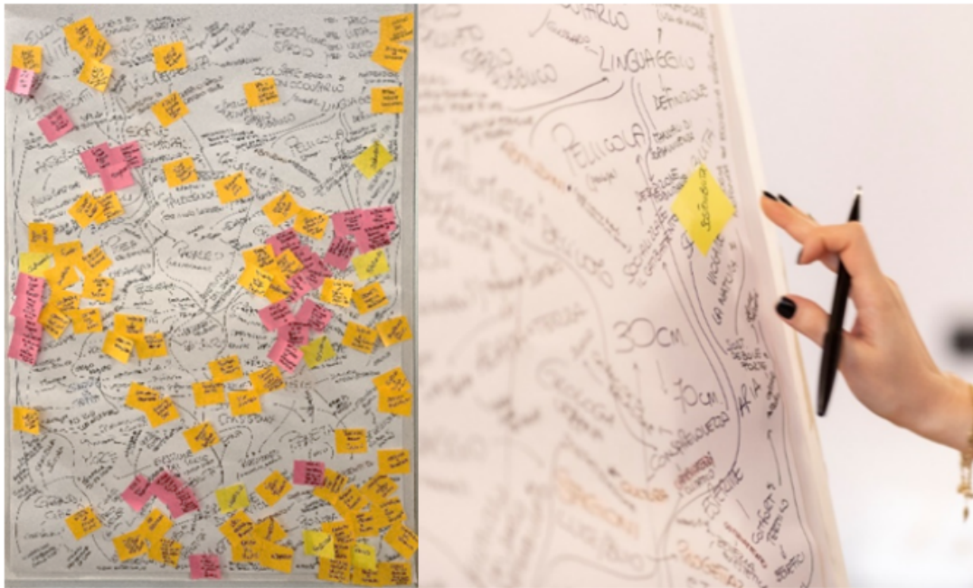
PICTURE 3 - THE LIVE BOARD COLLECTING CONCEPTS, KEYWORDS AND CONNECTING TOPICS